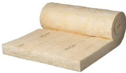
Figure: Representation of product