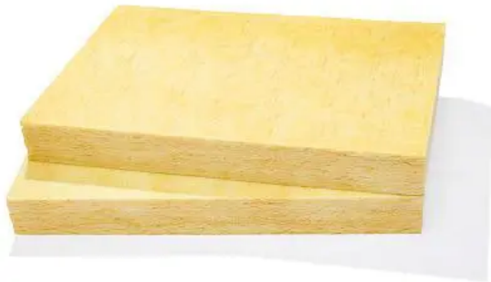
Figure: Representation of product