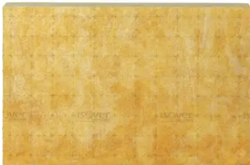
Figure: Representation of product