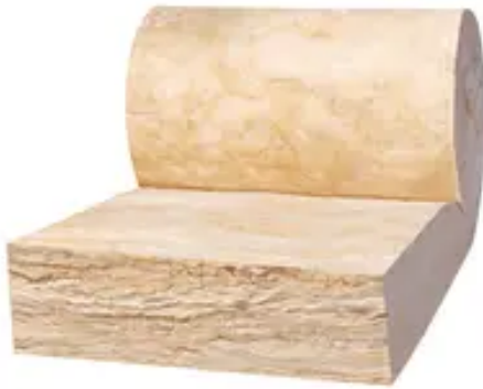
Figure: Representation of product