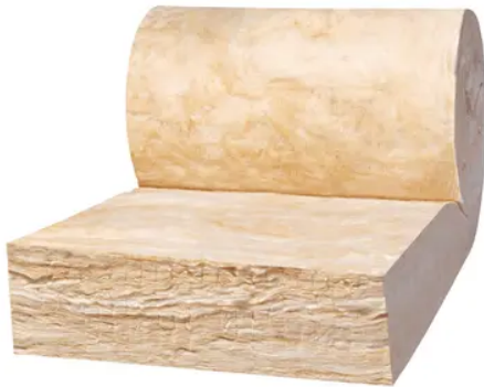
Figure: Representation of product