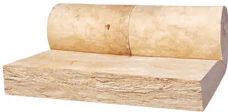
Figure: Representation of product