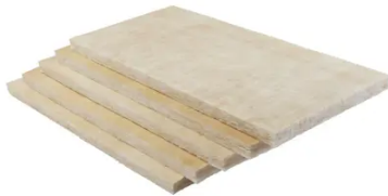
Figure: Representation of product