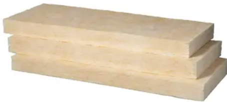
Figure: Representation of product