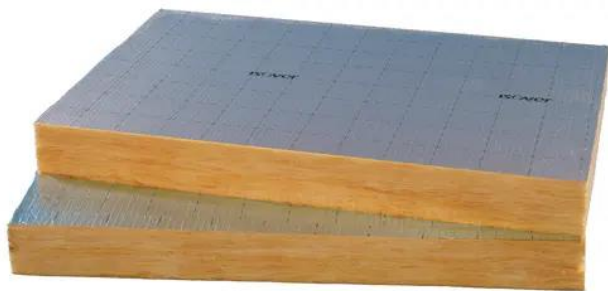
Figure: Representation of product