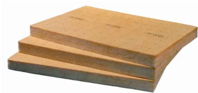
Figure: Representation of product