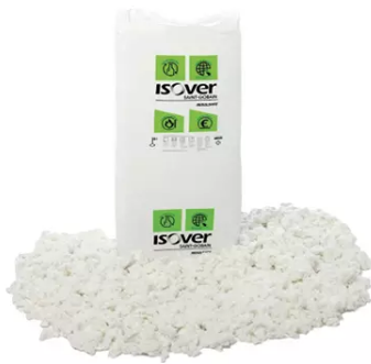
Figure: Representation of product