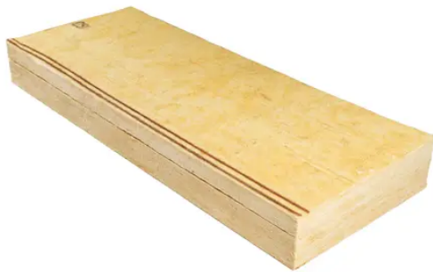
Figure: Representation of product