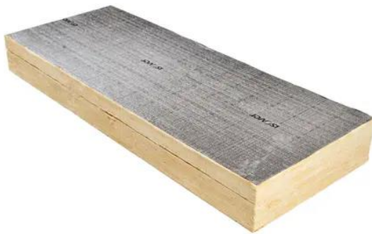
Figure: Representation of product