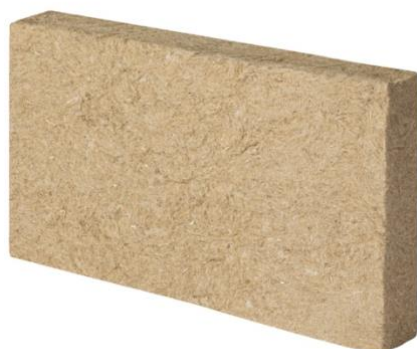
Figure: Representation of product